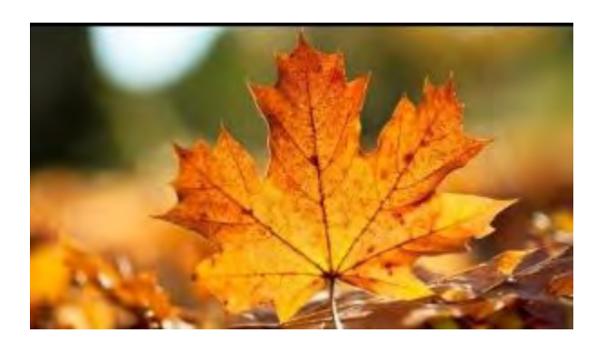
An Autumnal Prayer

Please see <a href="http://fumcrestview.com/calendar-1">http://fumcrestview.com/calendar-1</a> for any updates or changes